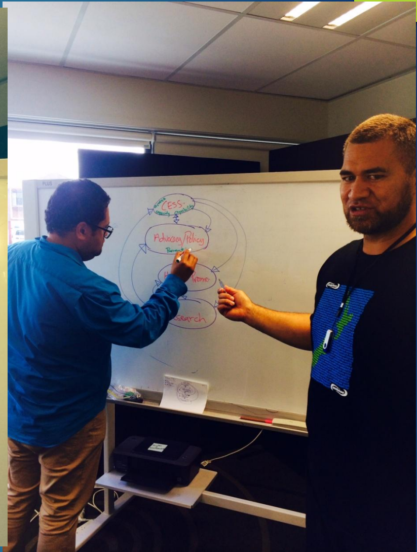
Ngā Manukura, Te Mana Whakahaere