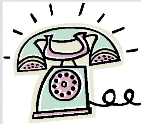
Follow up Calls